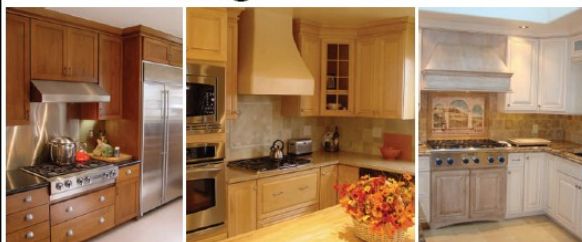
Omega, Dynasty, and Kemper Cabinetry