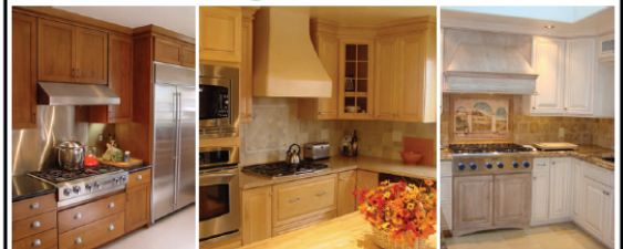
Omega, Dynasty, and Kemper Cabinetry